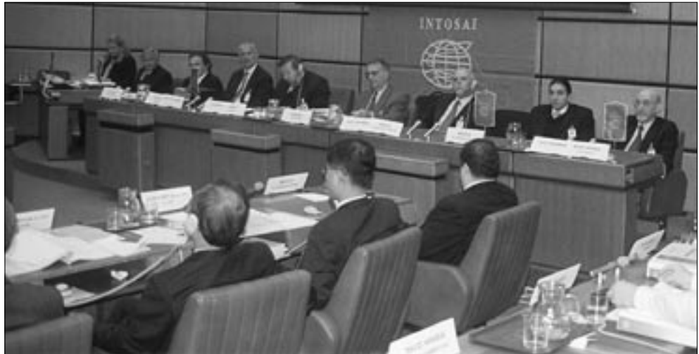
SAI heads and staff from Hungary, Mexico, Saudi Arabia, and Austria at the head table during the Governing Board meeting in Vienna in November 2005.

The influence of INTOSAI's strategic plan was evident at the INTOSAI Governing Board's annual meeting in Vienna on November 10-11, 2005. The meeting agenda was structured to reflect the four goals in the strategic plan (see new INTOSAI organization chart on p. 6) and, under the able leadership of Dr. Arpad Kovacs, the board continued to make progress in implementing the plan's strategies and recommendations.