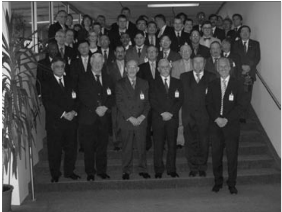
Governing Board members, observers, and staff pause during the meeting for an official photograph.

meeting. In addition, the board approved the committee's recommendation that the savings gained by reducing INTOSAI's annual allocation to the Journal (from 35 percent to 25 percent of the overall INTOSAI budget) should be reallocated equally to capacity-building/IDI and knowledge-sharing/collaboration tool activities in support of the strategic plan. The committee believes that INTOSAI's enterprisewide relations with global donors should be coordinated centrally and in advance within INTOSAI's Governing Board and General Secretariat and with input from the Finance and Administration Committee. Regarding relations with external partners, the committee chairman stressed the importance of INTOSAI's presenting a clear and coherent plan for dealing with global donors; this issue will be discussed further at the committee's February 21-22, 2006, meeting in Riyadh.