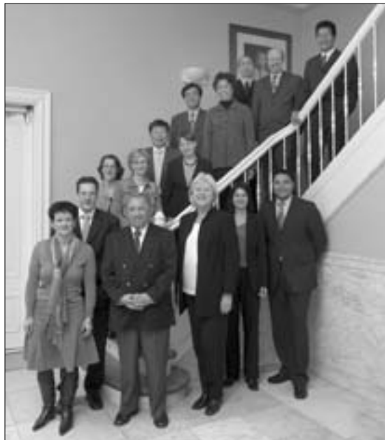
Members of the Task Force on Accountability and Audit of Disaster-Related Aid at their December 2005 meeting in The Hague.

Other issues discussed at the December meeting included funding for the initiative and establishing contacts with other relevant organizations, such as the United