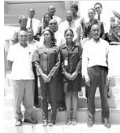
Staff of the Barbados SAI

When Barbados became an independent nation in 1966, the Auditor General's Office was embodied in the Constitution. The office has responsibilities for the annual audit of ministries, departments, and statutory bodies that receive funding from the Crown. In addition, the office can examine the