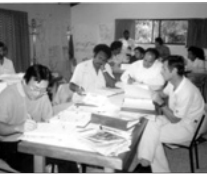
A 1990 SPASAI/IDI training managers workshop in New Zealand.