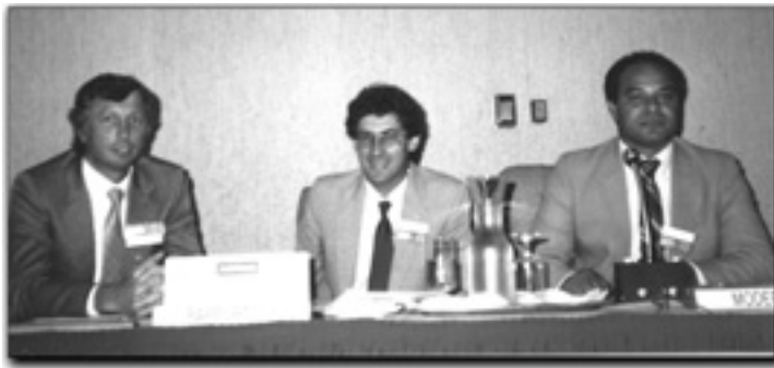
A discussion group with delegates from Australia and Tonga at the 12th INCOSAI.

Hosted by the Australian National Audit Office