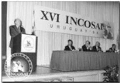
Dr. José María Sanguinetti, President of the Republic of Uruguay, formally inaugurates the 16th INCOSAI.

In addition to hosting the 16th INCOSAI in 1998, the Court of Audit of Uruguay was an active participant in the INTOSAI Congresses held in Washington, D.C., in 1992; in Cairo, Egypt, in 1995; in Seoul, South Korea, in 2001; and also in the 2003 Governing Board in Budapest, Hungary. This has provided the experience and perspective needed to answer the INTOSAI Secretary General's kind invitation to express our opinion regarding the importance of these international events.