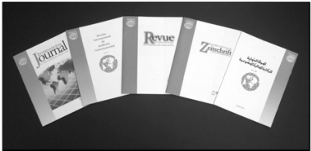
The Journal is published in the five official languages of INTOSAI: (left to right) English, Spanish, French, German, and Arabic..

Looking to the future, the Journal stands ready to support INTOSAI’s strategic plan and play a role in its implementation, especially in the area of knowledge sharing. With the continued support and participation of member SAIs, it will continue its success as the premier international magazine of government auditing.