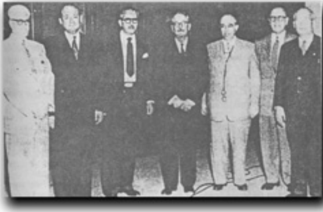
Members of the SAIs of France and Cuba attending the first INCOSAI in Havana.

To build, over five decades, an international organization capable of bringing together more than 180 Supreme Audit Institutions (SAI) worldwide is no doubt a significant historical achievement on the threshold of the 21st century. It is particularly significant given the rapid technological evolution and decisive economic, political, social, and ecological changes linked to an accelerated process of globalization over the past 50 years.