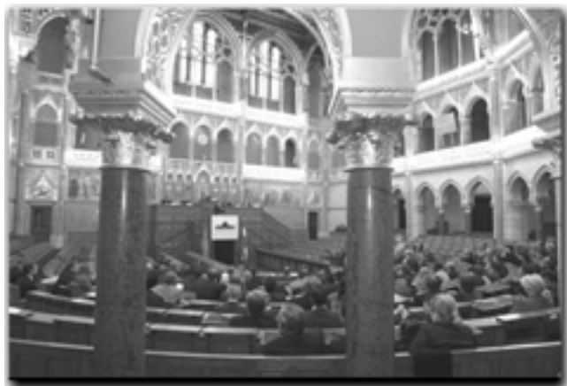
The ceremony in the Hungarian Parliament celebrating INTOSAI's 50th anniversary.

It was a great honor for the State Audit Office of the Republic of Hungary to be nominated to host the 50th anniversary celebration of the founding of the International Organization of Supreme Audit Institutions (INTOSAI) on October 15, 2003, and the 18th International Congress of Supreme Audit Institutions (INCOSAI), October 10-16, 2004. Although these events are independent of each other, they are closely related.