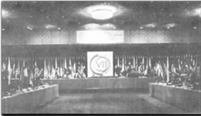
Plenary session of the 7th INCOSAI in Montreal.

In 1971, the 7th International Congress of Supreme Audit Institutions, which was hosted by the Office of the Auditor General of Canada, had an important impact on the future role and work of the office. The developments culminated in the passing of a new Auditor General Act by the Parliament of Canada in 1977. This act expanded the office's role by providing the Auditor General with the mandate to perform value-for-money audits.