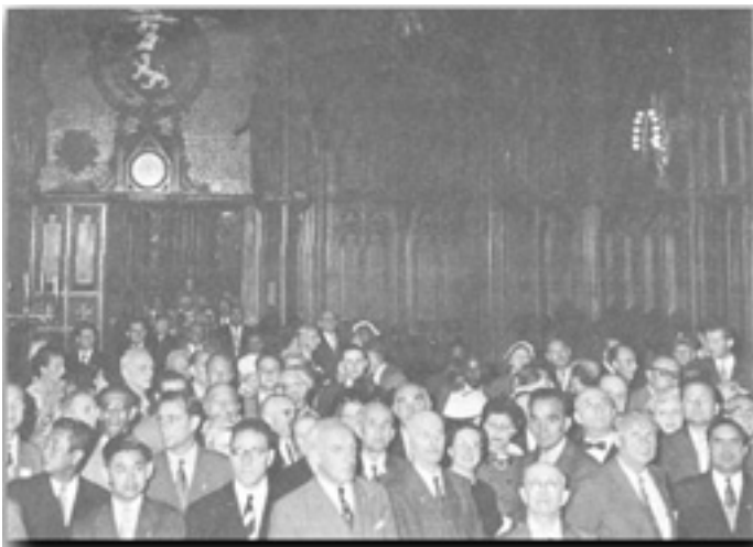
Delegates to the 2nd INCOSAI in Brussels.

With regard to the third theme, the Belgian legislature has, from the very beginning, addressed the need to audit the enterprises and organisms in which the government has a financial interest. Changes made to this legislation during the last decade to