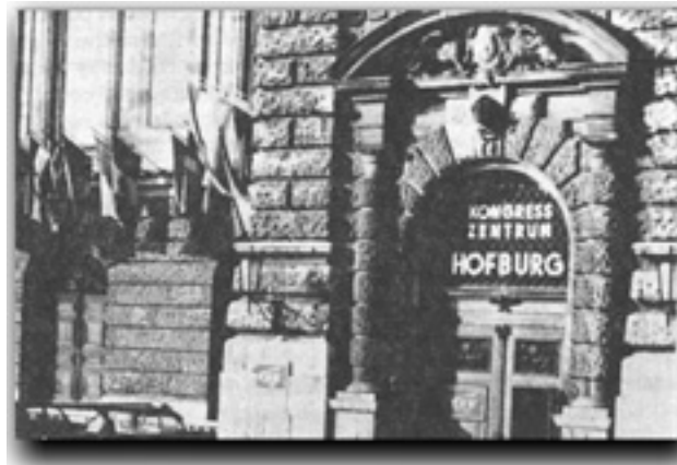
Venue of 4th INCOSAI in Vienna.

Hosted by the Court of Audit of the Republic of Austria