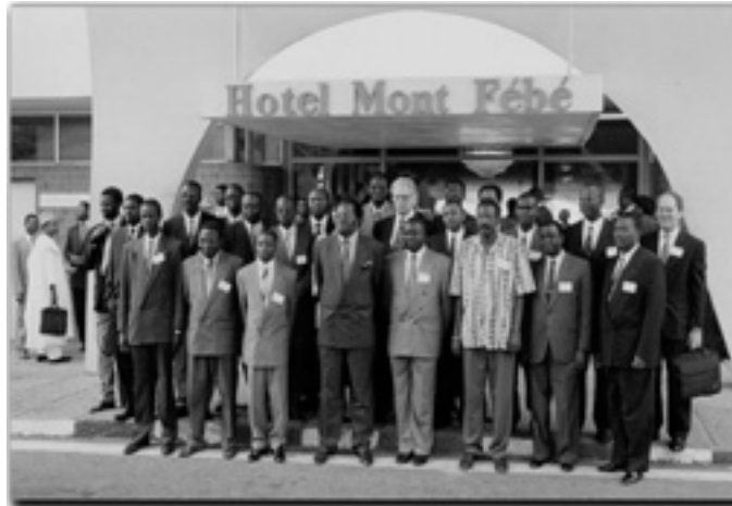
Participants in the 1997 Strategic Planning Workshop for AFROSAI/ Francophone SAIs in Cameroon.

AFROSAI was created in November 1976 after the Constitutive Congress and followed by the first General Assembly in Yaoundé, Cameroon. The seat of AFROSAI is in Lomé, Togo, the Permanent Secretariat of the organization.