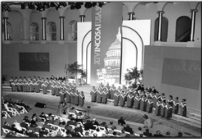
Opening ceremony of the 14th INCOSAI in Washington, D.C.

Hosted by the U.S. Government Accountability Office