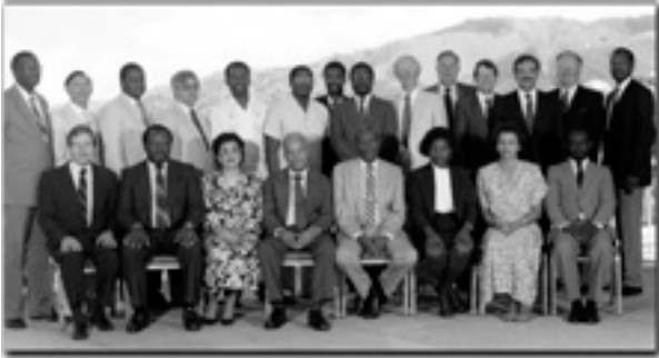
The founding members of CAROSAI at its Inaugural Congress in 1988.

The Caribbean Organization of Supreme Audit Institutions (CAROSAI) is the sixth regional organization of INTOSAI. Its official and working language is English, and all countries in the Caribbean, whether independent or dependent, are eligible for membership as ordinary members or associate members. Membership of CAROSAI now stands at 21 SAIs.