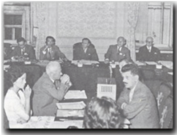
Plenary session of 2nd INCOSAI.

INCOSAI—which considers the audit of commitments as the most effective modality for a preventive control—one must point out that both the financial inspectorate and the commitment auditors, who enjoy complete independence, perform the audit of commitments.