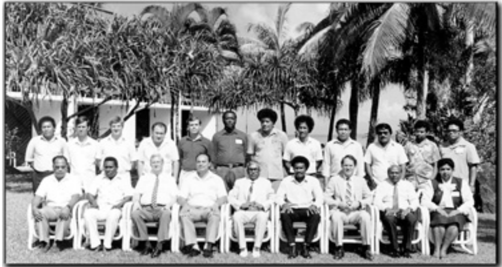
SPASAI/IDI seminar on human resources management held in Fiji in 1989.

The objective of SPASAI, one of the seven regional working groups of INTOSAI, is to “encourage, promote and advance co-operation among members in the field of Public Audit.” 1