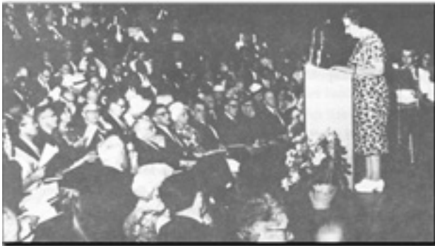
Then Foreign Affairs Minister Golda Meir of Israel addresses the delegates to the 5th INCOSAI in Jerusalem.

Israel hosted the 5th INCOSAI in June 1965. It was a significant event from the point of view of both the State Comptroller's Office and the public. The Congress was covered in the local and international media and aroused much public interest.