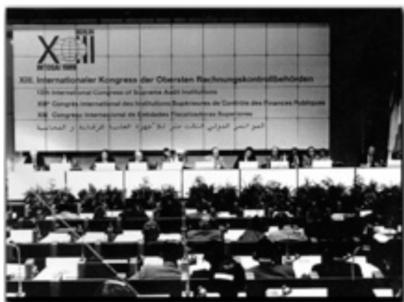
Theme officers discuss management in government auditing at the 13th INCOSAI.

The 13th INCOSAI, held in Berlin, June 12-21, 1989, has had a profound influence lasting to the present day on the Congress host, the German Federal Court of Audit (Bundesrechnungshof). The Court has been able to implement recommendations made at the Congress and continues to consider them to be valuable guidance. The recommendations relate to the three Congress themes.