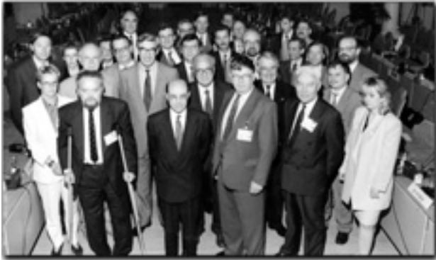
Members of the Board of Governors of EUROSAI in 1993.

EUROSAI, which was only 13 years old on the 50th anniversary of INTOSAI, is the youngest in the family of regional organizations.