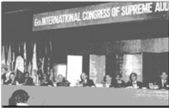
Congress officers of the 6th INCOSAI.

The 6th INCOSAI was held in Tokyo from May 22-30, 1968, with delegates from some 70 SAIs in attendance. This was the first INTOSAI meeting held in Asia. Its most significant achievement was the adoption of INTOSAI's Standing Orders, by which INTOSAI was formally established as a permanent international institution.