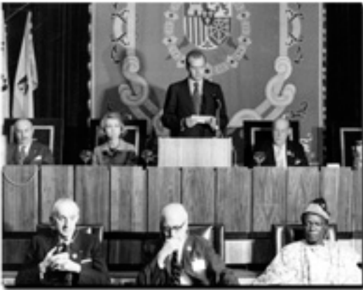
Then Prince Juan Carlos of Spain declares the 8th INCOSAI open.

The successive INTOSAI Congresses have in all cases made a mark on the host SAIs, providing them with a significant and enriching experience from both the technical and human points of view. The Congresses provide an awareness of the importance of reciprocal cooperation and understanding between peoples and of common, shared interests among a community that is based on permanent, fundamental principles (justice, freedom, and respect for the law), enabling a just and peaceful international order to be established and firmly maintained. The Congresses also underscore the importance of seeking the best systems and methods for auditing the management of public finances to ensure their lawful, regular, effective, efficient, and economical application. This spirit encourages them to perform their tasks efficiently and to adapt to, and if possible anticipate, the new requirements of a society undergoing continuous, rapid change, acting as its driving force rather than being driven by it.