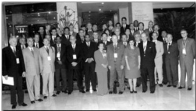
Delegates to the 2003 OLACEFS Assembly in Havana, 50 years after the 1st INCOSAI was held in that city.

OLACEFS has a rich history that dates back to 1953. Since that date, it has structured itself as an international organization, and an overall view of its mission reveals that it has taken a path of continuous growth that enables it to realistically project the gradual achievement of its established objectives.