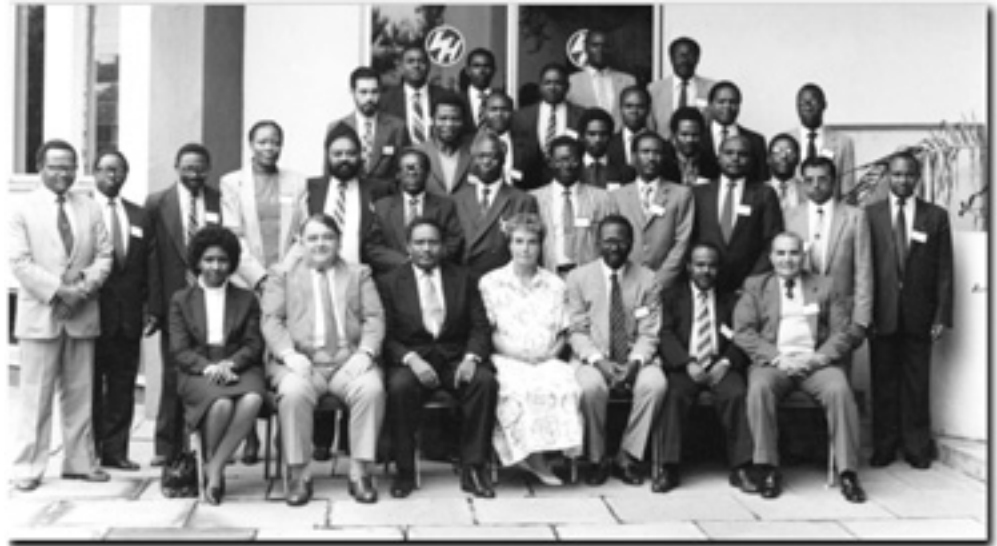
Participants and instructors in 1988 AFROSAI/IDI course in Kenya.

IDI's history can be divided into three periods. From 1986 through 1995, the programs were typically technical training courses tailored to meet the concrete needs of SAIs in different regions. The emphasis was on (1) enhancing the skills of audit practitioners through courses on audit planning and supervision, computer auditing, and audit testing and (2) equipping training and personnel managers with new skills through training manager workshops and human resource management seminars.