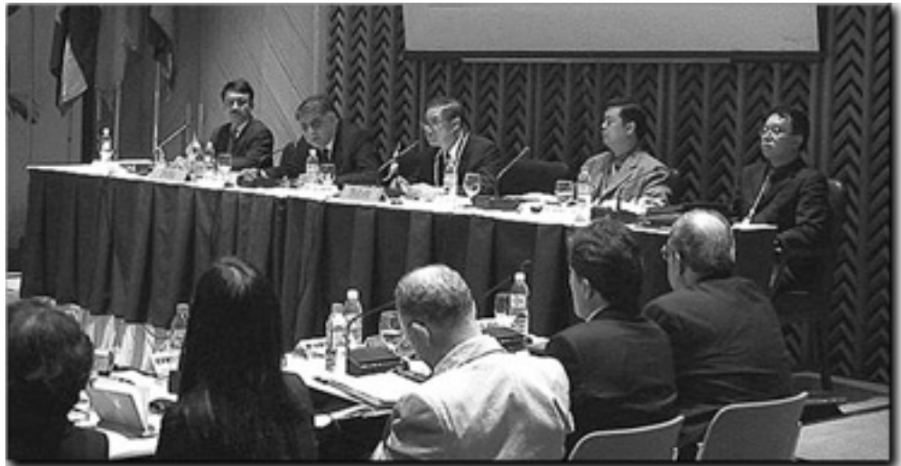
Heads of SAIs from India, the Philippines, and Thailand address the 9th ASOSAI Assembly in Manila in 2003.