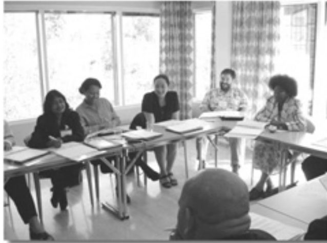
Small group discussion at 2001 IDI Symposium of IDI Training Specialists, attended by 158 specialists from 82 countries.

INTOSAI standing committees and working groups), and exploring distance learning as a new training vehicle for SAIs.