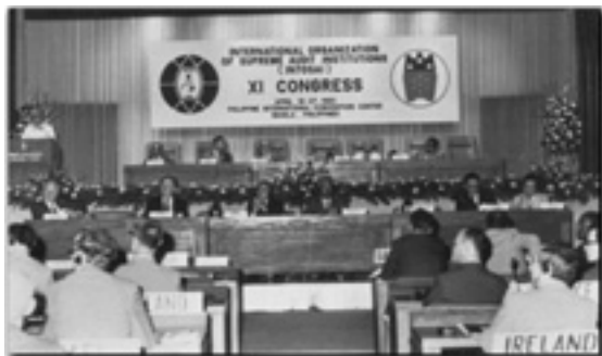
Opening session of the 11th INCOSAI in Manila.

Programs already in place before 1983 have been enhanced with even broader support, since training and the development of Commission staff at all levels is a basic concern. Partnerships with academic and training institutions like the University of the Philippines, the Asian Institute of Management (AIM), and the Development Academy of the Philippines have been forged to secure professional training of Commission officials and personnel. Through networking with the National Economic Development Authority (NEDA), the agency in charge of foreign scholarships, the Commission ensured access of middle managers to post-graduate studies in business and public administration offered by foreign institutions.