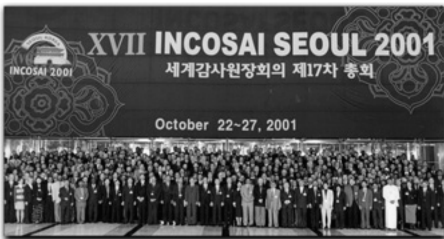
Delegates to the 17th INCOSAI in Seoul.

As INTOSAI approached its 50th anniversary in 2003 and in the midst of global changes not seen in the last century, INTOSAI needed a plan to help SAIs better