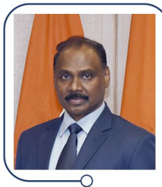
H.E. Mr. Shri Girish Chandra Murmu