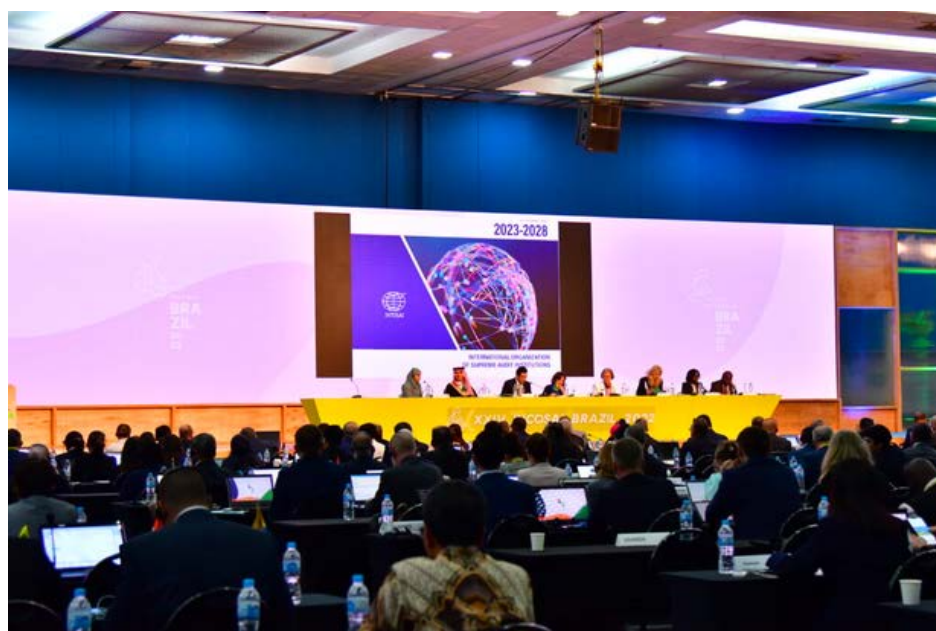
Presentation of the 2023-2028 INTOSAI Strategic Plan