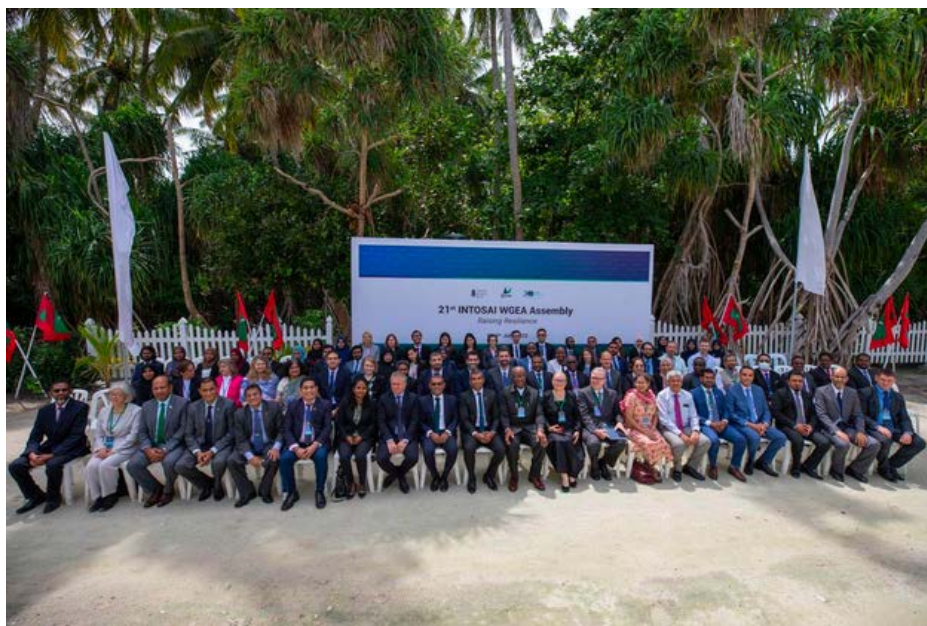
Participants of the 21st INTOSAI WGEA Assembly in the Maldives.