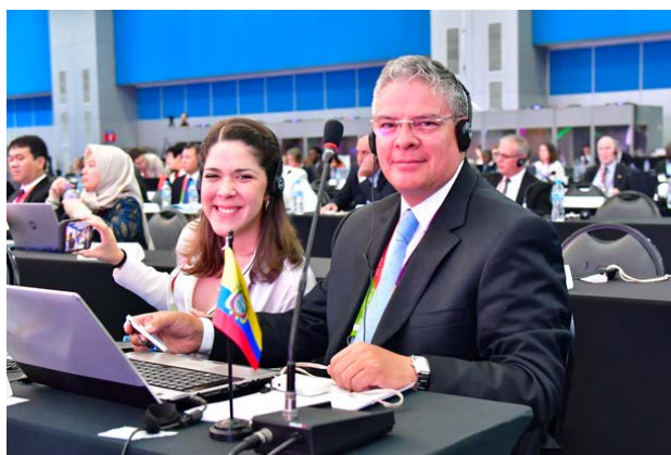
Contraloría General del Estado del Ecuador

A number of SAIs were appointed and reappointed to serve as members of the INTOSAI Governing Board. SAI Egypt will serve as the first Vice-Chair of the Governing Board, as the SAI will host the next INCOSAI in 2025.