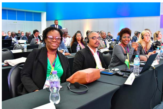
The Auditor General's Department Jamaica

The SAIs of Jamaica and Ecuador were nominated and approved as INTOSAI's auditors for the 2022–2024 financial statements.