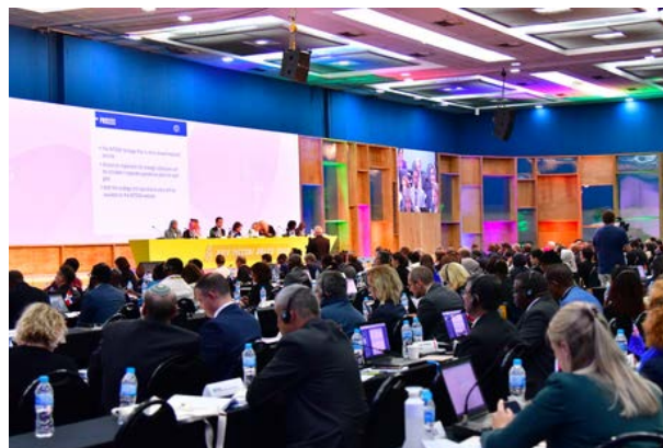
Presentation of the 2023-2028 INTOSAI Strategic Plan