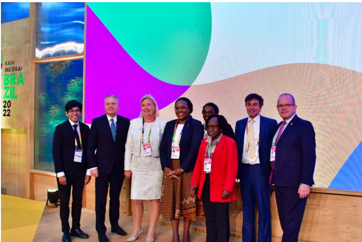
Capacity Building Committee