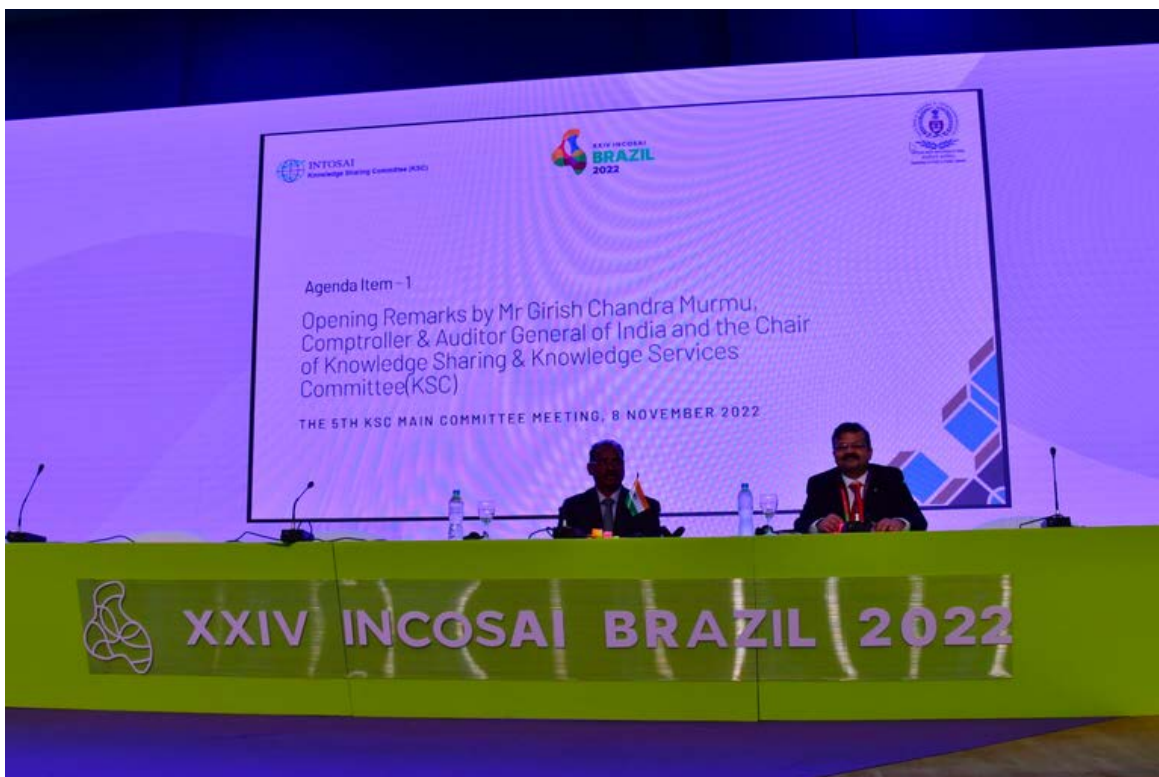
Knowledge Sharing Committee

Additionally, a number of guidance materials, research, papers, training materials, and audit tools developed by INTOSAI working groups were acknowledged at INCOSAI, and will be included in the INTOSAI Community Portal . Working groups that contributed to these INTOSAI Public Goods include the working groups on Big Data, Environmental Auditing, Extractive Industries, Fight Against Corruption and Money Laundering, and IT Audit.