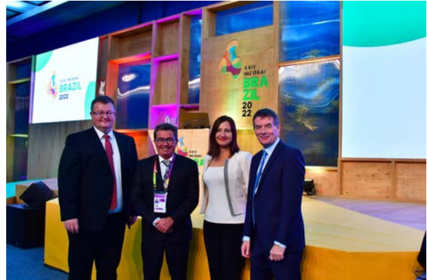
Professional Standards Committee