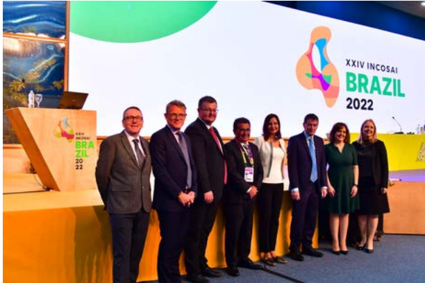
Professional Standards Committee