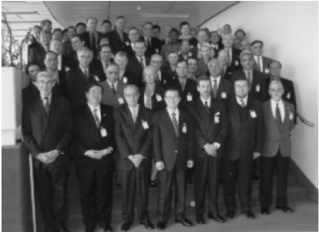
Governing Board members in Vienna

INTOSAI's Governing Board convened in Vienna, Austria, for its 50 th meeting and took a number of decisions to position INTOSAI to effectively address the many challenges facing the organization and its member SAIs. The following Board member countries engaged in lively discussion and debate during the 2-day meeting on October 16-17, 2002: Korea (chairman), Hungary (first vice-chairman), Saudi Arabia (second vice-chairman), Austria (general secretary), Antigua and Barbuda, Brazil, Burkina Faso, Egypt, India, Japan, Norway, Peru, Portugal, Tonga, Tunisia, the United Kingdom and the United States. Joining in as observers and reporting on their committees' progress were the SAIs of Canada, Sweden, Mexico, France and Belgium; the European Court of Auditors also sent three observers.