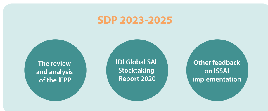
Figure 2: Sources used in the analysis for the SDP 2023-2025.

Several sources of information from users of the IFPP indicate challenges in implementing the framework due to a lack of clarity. In addition to the review and analysis of the IFPP , the IDI Global SAI Stocktaking Report 2020 file (idi.no) concluded that three main and feedback from working bodies within INTOSAI engaged in standard setting.