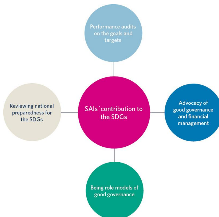
Figure 2: Four potential ways for the SAIs to contribute to more effective implementation of the SDGs