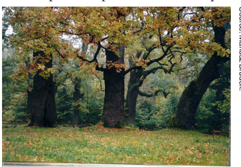
The Puszcza Bialowieska forest, located in both Belarus and Poland, was the subject of a joint parallel audit of environmental protection regulations by the SAIs of both countries

In addition to bilateral cooperation with Central and Eastern European countries, the SCC has in recent years carried out joint parallel audits, including some with neighboring countries. According to the INTOSAI WGEA booklet on how SAIs can cooperate in the audit of international environmental accords, a joint parallel audit is conducted by a team of auditors from two or more SAIs who prepare a single, joint audit report for publication in all participating countries.