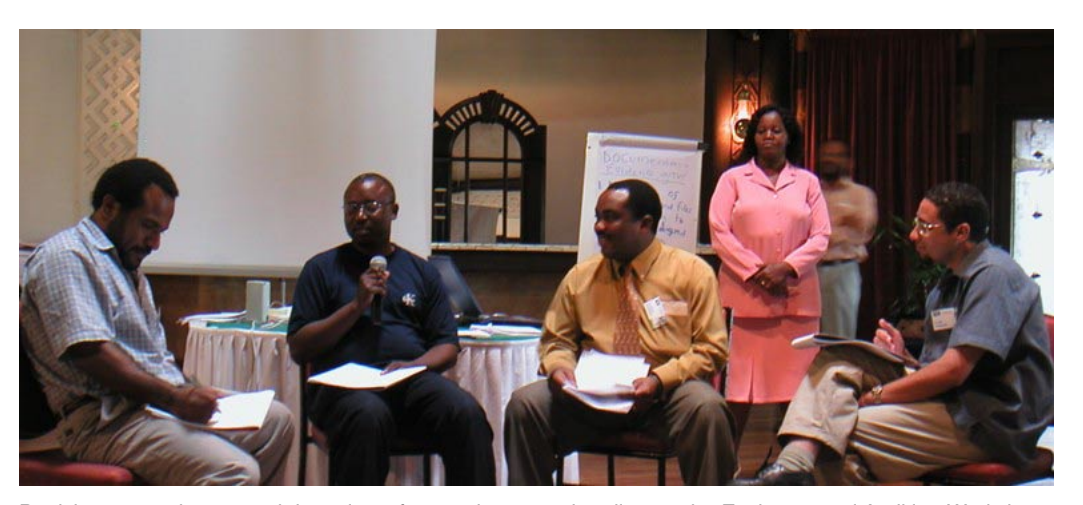
Participants conduct a mock interview of an environmental auditee at the Environmental Auditing Workshop in Kenya.

This 10-day workshop, which aims to transfer knowledge of environmental issues along with the "how-tos" of environmental auditing, requires that participants prepare environmental auditing proposals to be submitted to management when they return to their SAIs. A final version of the course materials will be made available to participants and their SAIs on CD-ROM later in 2004 and will also be added to the IDI International Training Directory, available on the IDI Web site.