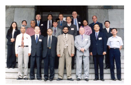
Working Group on the Audit of International Institutions' meeting in Tokyo in April 2003.

To date, the working group has held five meetings hosted by different participating SAIs. At the first meeting, it prepared a work plan that was approved by the Governing Board at its 50th meeting. Since the working group has a time-restricted mandate, the work has been intensive, with the member SAIs preparing documents and exchanging them between the meetings. Each member SAI has also compiled a list of international institutions of which its country is a member as input to the global list.