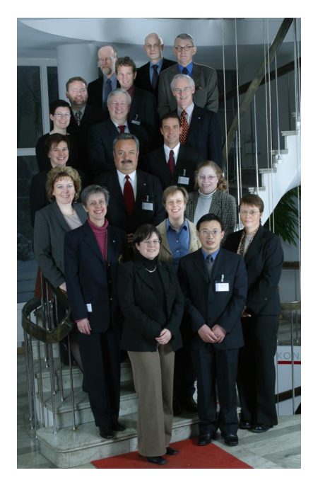
Members of the ASC panel, IFAC representatives, and Swedish SAI staff at their January 2004 meeting in Stockholm to discuss their upcoming collaboration on international standards of

Members of the INTOSAI Auditing Standards Committee's (ASC) reference panel of audit experts met in Stockholm, Sweden, January 28-30, 2004, to discuss upcoming work with the International Federation of Accountant's (IFAC) International Auditing and Assurance Standards Board (IAASB). Ten audit experts were able to attend the Stockholm meeting, which also included two representatives of the IFAC IAASB, the project secretariat set up at the Swedish National Audit Office, and other Swedish audit staff.