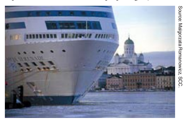
The SCC coordinated the audit reviewing protection of the Baltic Sea from pollution originating on land.

Poland's SCC coordinated the Helsinki Convention audit that was carried out in 2001 by the SAIs of the countries wete convention signatories: Denmark, Estonia, Finland, Latvia, Lithuania, Poland, the Russian Federation, and Sweden. The objective of the audit was to assess the implementation of Helsinki Convention provisions related to the protection of the Baltic Sea against pollution originating on land. The cooperating parties conducted the audits according to their authorities and developed the Common Position on Cooperation and Program Assumptions of the Audit Program as the basis for their cooperation. Each SAI was responsible for its own audit and for the way its results were presented in the general section of the report. The summaries of national reports served as a basis for preparing a joint final report.