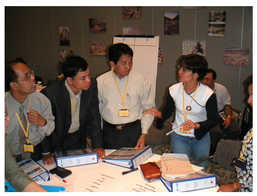
At the pilot environmental auditing training course in Turkey in November 2003, participants work on an interactive exercise to learn ecosystem vocabulary.

The course does not depend completely on lectures. It is taught by IDI-certified instructors and is based on IDI's Long Term Regional Training Program (LTRTP) and its learner-centered approach. The course is highly interactive, using a combination of lectures, individual and group exercises, homework assignments, and readings.