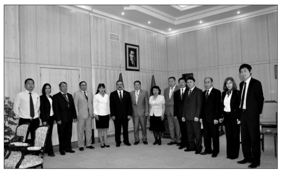
Participants in the value-for-money training program the Turkish SAI provided to staff of the Mongolian SAI.

The programs, which covered theoretical and practical training, gave TCA the opportunity to share the Turkish experience regarding VFM audit. The program covered a range of audit topics, such as principles and procedures of performance audit, a comparison of performance audit and performance evaluation, understanding the entity and its environment, selection of performance audit topics, issue analysis, main question and subquestions, developing audit criteria, methods of gathering evidence, interviews and focus groups, field work, developing audit conclusions and recommendations, documentation of audit evidence, reporting, the followup stage of performance audit, IT audit, and audit management.