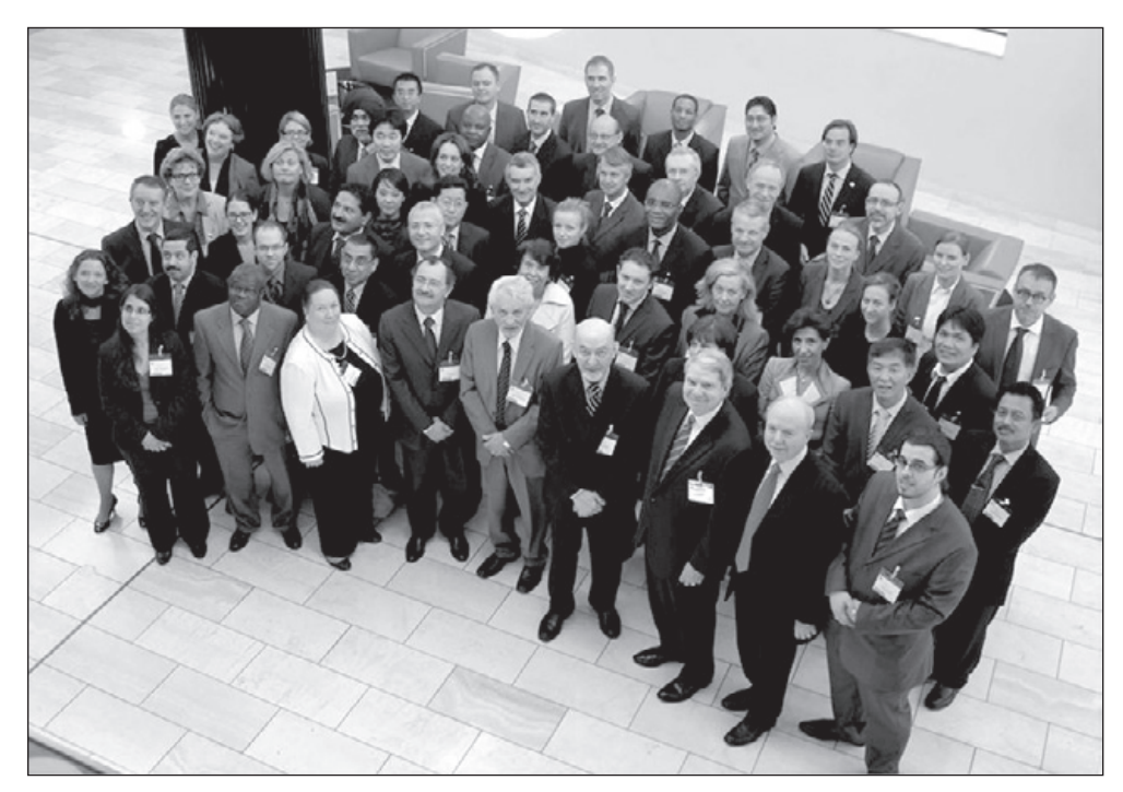
Participants in the meeting of the Steering Committee of the INTOSAI-Donor Cooperation in London in October 2012

The U.K. National Audit Office hosted the 5th Steering Committee meeting of the INTOSAI-Donor Cooperation in London October 18–19, 2012. The meeting had a record attendance and included a ceremony to celebrate the signing of the INTOSAI-Donor memorandum of understanding (MOU) by three additional donors: the Asian Development Bank, the Australian Agency for International Development, and the GAVI Alliance. The MOU now has 19 donor signatories.