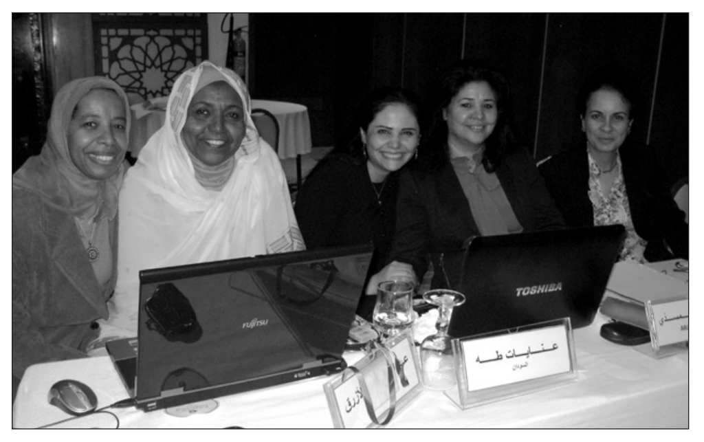
Instructors for the Facilitation Skills Workshop of the IDI/ARABOSAI Program on Quality Assurance.

The IDI/ARABOSAI Needs Assessment Program conducted in 2007 and 2008 revealed an urgent need for capacity development in quality assurance in many SAIs. IDI and the region therefore launched a quality assurance program in 2011 to train SAI staff in conducting quality assurance reviews at the institutional level and for financial and performance auditing. After attending the Workshop on Quality Assurance, the participants conducted quality assurance reviews in their respective SAIs and reconvened in November 2012 to get feedback on their work at a quality assurance systems review meeting. In addition, the participants attended a Facilitators Skills Workshop to enable the SAIs to train additional staff members in quality assurance. A quality assurance handbook is being developed as part of the program and all participating SAIs are expected to adapt the handbook to their circumstances.