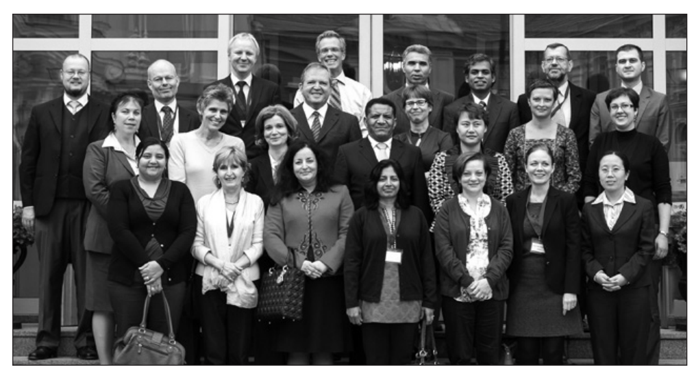
Participants in the 10th meeting of the Compliance Audit Subcommittee in Lithuania in September 2012.

The agenda of the 2-day meeting focused on the level 3 ISSAI 100 ( Fundamental Principles of Public Sector Auditing ) exposure draft and final discussion and decision within CAS on the ISSAI 400 ( Fundamental Principles of Compliance Auditing ) draft. Participants also discussed the future advancement of the level 4 ISSAI 4300 draft of compliance audit guidelines for the court of accounts model. The committee further discussed implementation and maintenance of the level 4 ISSAI 4000-series on compliance audit endorsed at the XX INCOSAI, particularly regarding the ISSAI Implementation Initiative (3i) Program the INTOSAI Development Initiative presented at the meeting.