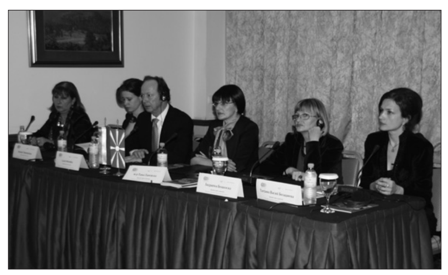
Members of the project team at the public release of the Introduction to Audit Reports manual in Skopje, Macedonia, in November 2012.

The project team comprises representatives from the SAO, NCA, and Westminster Foundation for Democracy. Following meetings held in May 2012 in The Hague and in September 2012 in Skopje, the project team defined the final contents of the manual. It was officially released in November 2012 in Skopje.