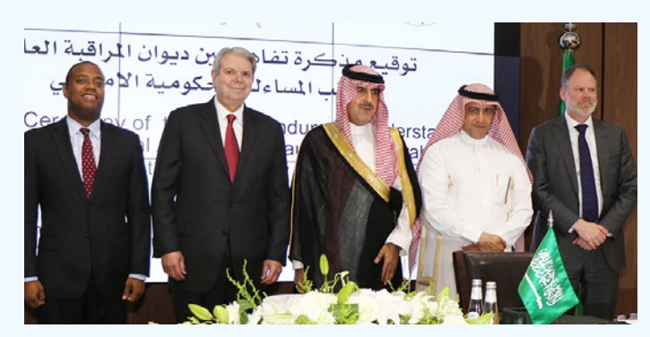
Participating in the 2017 INTOSAI PFAC meeting hosted by Saudi Arabia's General Court of Accounts (GCA)