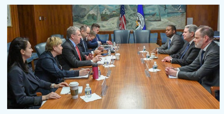
Visit with delegates from the Accounts Chamber of the Russian Federation, INTOSAI Chair, at GAO headquarters in Washington, D.C.