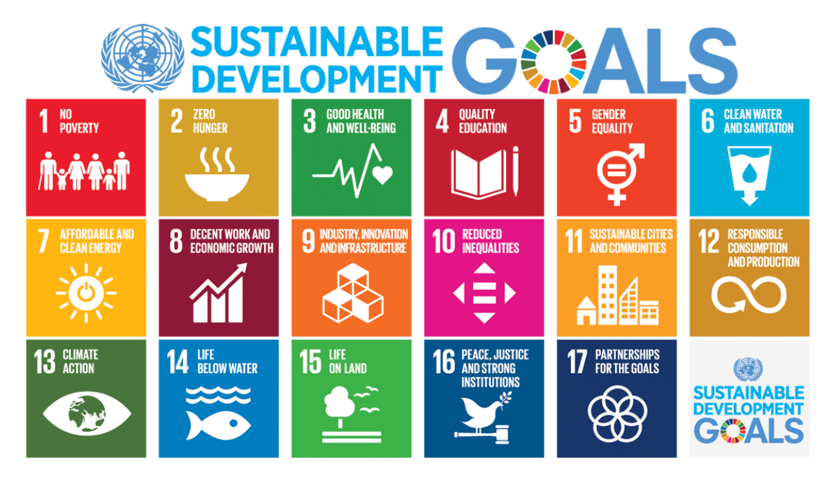
Figure 1: The sustainable development goals

4. These goals cover all areas of development and are of interest to both developed and developing countries. This diversity of the goals and their targets has given rise to several interconnections requiring the establishment of a coherent and comprehensive approach at the national level, together with the definition of priorities.