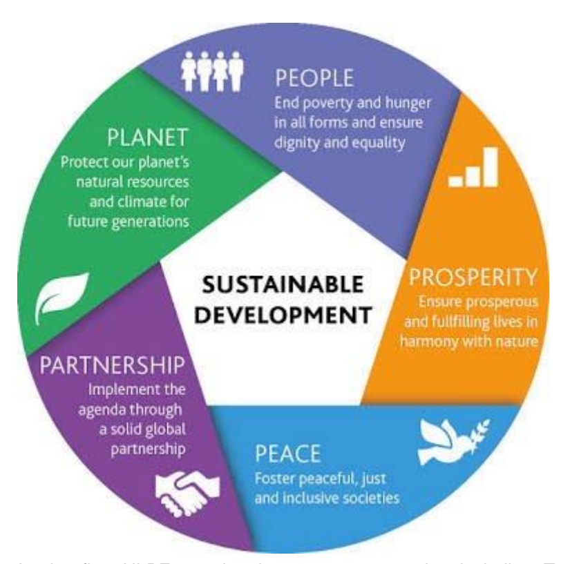
Figure 2: Sustainable Development and 5Ps

In the first HLPF meeting in 2016, 22 countries including Turkey presented their VNRs regarding the implementation of the 2030 Agenda and SDGs. VNRs are country reports for sharing the efforts, successes, and experiences of countries towards the implementation of the 2030 Agenda. They are tools for countries to measure and report their progress in SDGs, and for UN to monitor them. They are shared with the public via UN Sustainable Development Knowledge Platform.