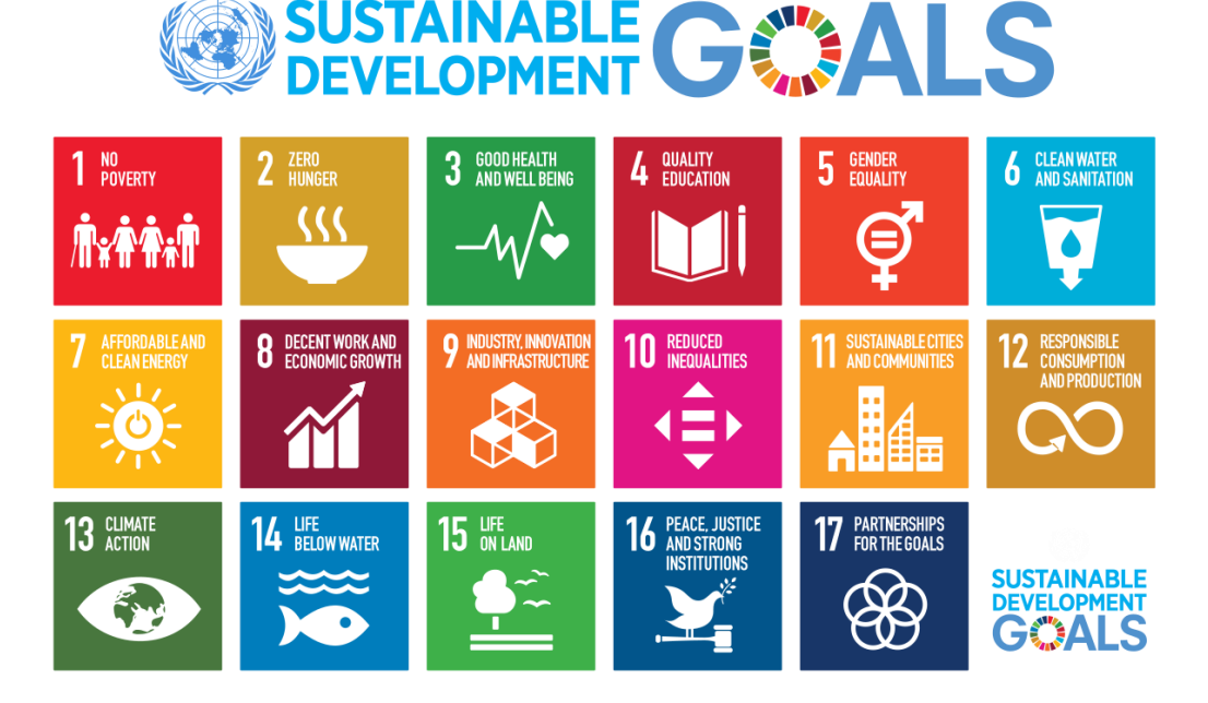
Figure 1: Sustainable Development Goals

The preamble of the 2030 Agenda says that the main principles of the SDGs were People, Planet, Prosperity, Partnership, Peace (5Ps) indicated in Figure 2. While implementing the goals, these five principles should always be taken into consideration, and goals should be implemented in compliance with the five principles.